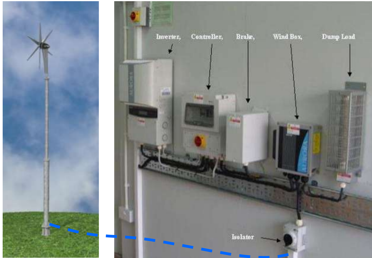
Equipment required along with the tower and turbine

Turbotricity™ is an Irish company making rugged, low maintenance wind turbines which will power your household requirements for decades to come. All components are either galvanised or stainless steel for durability. Ireland has the best wind conditions in Europe and we focus on providing reliable, effective turbines that can survive winds up to 140mph. Our unique combination of an air-core generator and electronics maximizes output in low wind conditions.